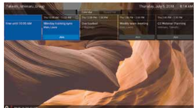
Calendar shown (Polycom One Touch Dial-enabled)